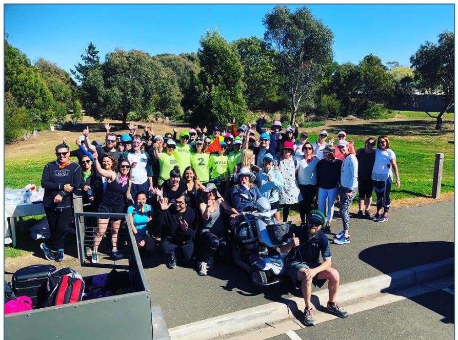
2018 Will2Walk walkers

Our amazing team of walkers completed a 20km walk from the Barwon Stroke Support Centre, Geelong, to Lake Lorne Reserve, Drysdale. We thank them for their commitment, hard work and passion to raise funds for the Barwon Centre.