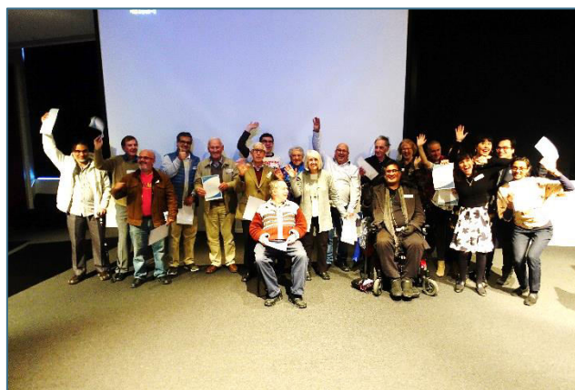
SAV Volunteers who were acknowledged at the Stroke Forum for their support, time and contribution to our Community.

With thanks to our major partner, AMP Australia, for their continued support and once again hosting the Stroke Forum, our guest speakers for taking the time to share their knowledge and experience, and our Forum Sponsors; Graduate House, The Graduate Union of The University of Melbourne, Greig Design & Construction and Ripples on the Bay.